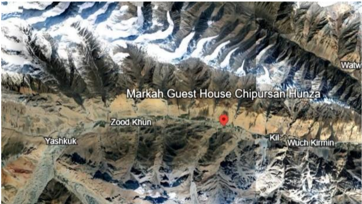
Figure 3: Seismometer installation location in Chipursan Valley